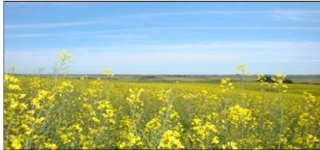
Canola Crop, RM of Morris No.312