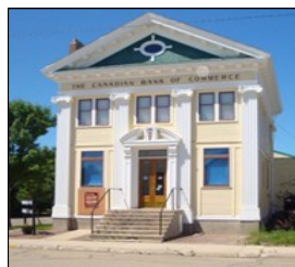
Historic Architecture, Town of Watson

Starting in 2011 the MSMA, in conjunction with Stantec Consulting and the Community Planning branch of the Ministry of Government Relations, has been working