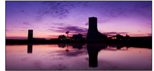
Potash Mine, RM of Usborne No.309

through the long process of adopting a District Plan. The MSMA has also been working to adopt new Official